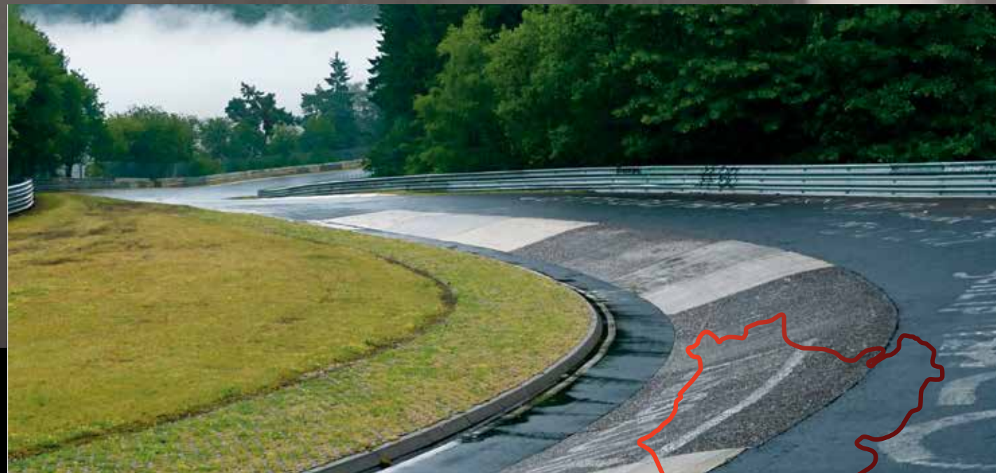
NÜRBURGRING'S FAMED KARUSSELL CORNER